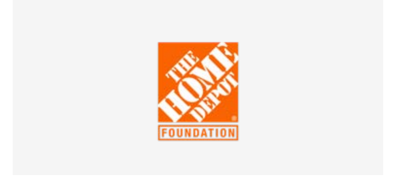
Primary logo on light background

The Home Depot Foundation logo is the primary visual symbol of our brand. It should be the first choice when choosing a graphic element for any type of representation.