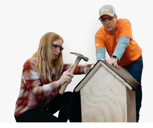
<sup>1</sup> Bureau of Labor Statistics Job Openings Survey (Construction Sector)

Work to train diverse talent to support the labor shortage