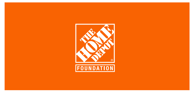
White logo on orange background