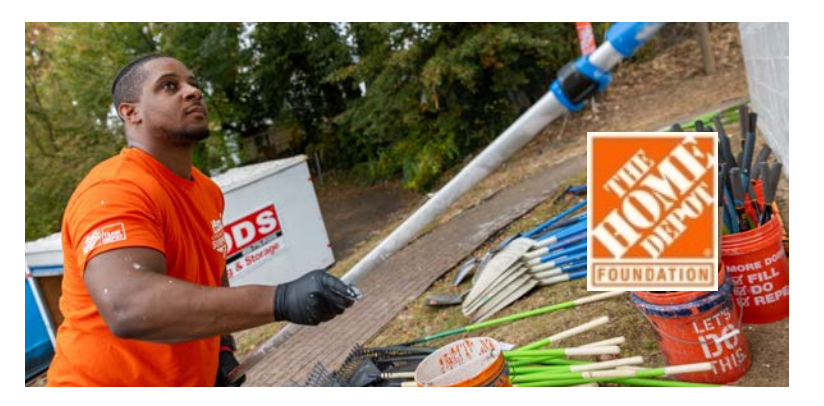
Primary logo with keyline on dark photo background